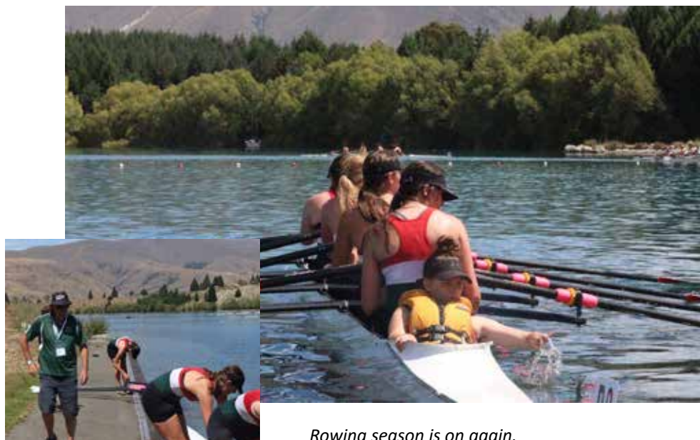
Rowing season is on again.