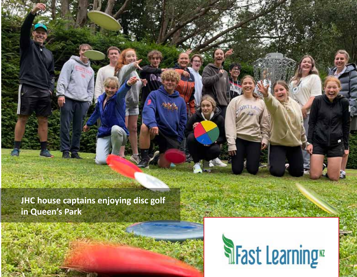
JHC house captains enjoying disc golf in Queen's Park