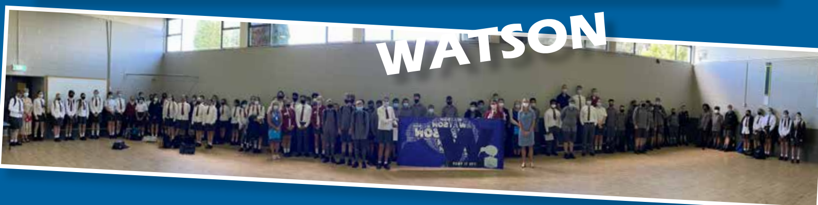
On Wednesday 2 February 2022 all Year 9 students gathered together in their Houses at the Senior Campus.