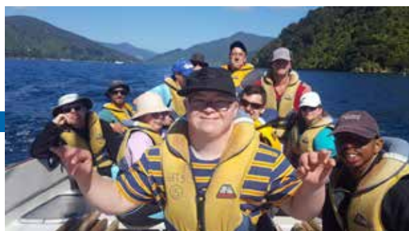
Outward Bound Adapted Courses