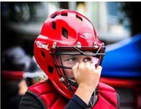
Below: Hockey at Taieri VS JHC Exchange