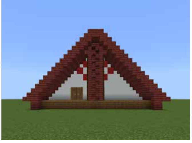
Top: Oliver Budd (Year 9) - Marae built in Minecraft Education Left: Salote Papau (Year 9) - Adobe Illustrator stars (using pucker and bloat effect) and Photoshop starry night background (using noise effect).