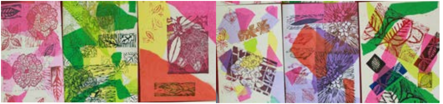
Year 10 Printmaking