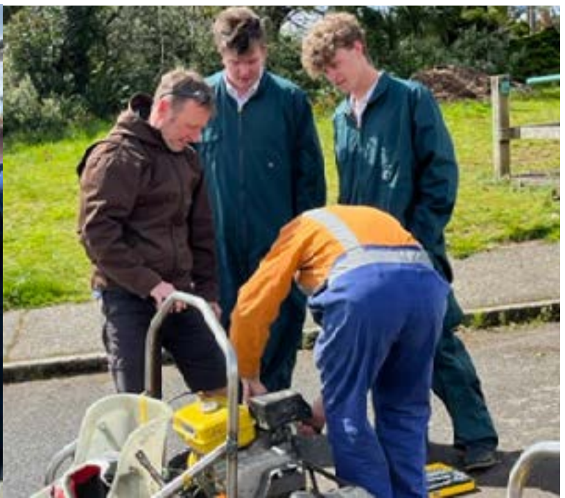
The annual Grass Carts event proved exciting as ever. Well done to all of our engineers, drivers and crew members on your success.