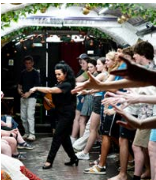
The students visiting Spain had a flamenco class in a gypsy cave in Granada

Congratulations to the staff with a 12-7 victory over the Seniors.