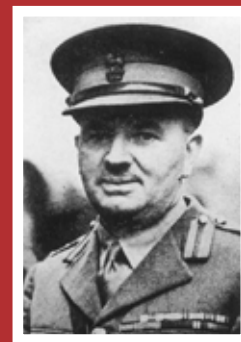
Brigadier James Hargest