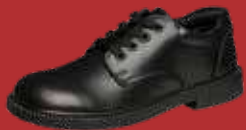
Regulation shoe style