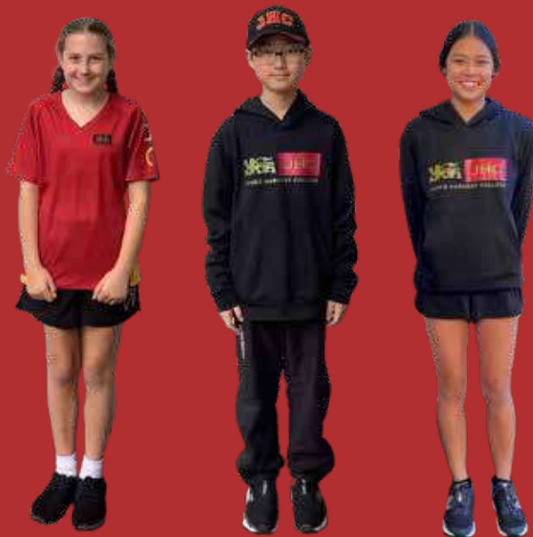
Year 7-10 PE uniform